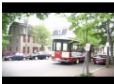
Massachusetts Poetry Festival Trailer (2011) 2:54 Watch this video highlighting some of the wonderfu...