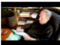
Stephen Dunn - Poets in Person - Episode 2 3:15 The Cortland Review presents Poets in Person: Epis...

FOOD FOR FESTIVAL THOUGHT: STEPHEN DUNN AND FRANK BIDART (SUNDAY POETS) ON PINGPONG AND HOLLYWOOD